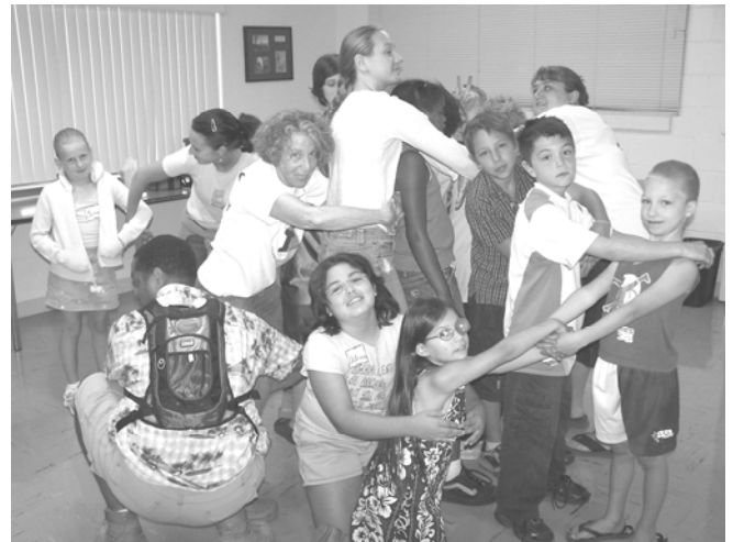
Posing Statues: a game to develop Tolerance, the theme of the day.

The program promoted a different theme for each day: Compassion and Kindness, Respect, Tolerance, Friendliness, Forgiveness, Cooperation, Flexibility, Justice, Courage, and Peacefulness. Learning about these values helped the children learn not only how to control their own behavior, but how to stick up for other kids and end the cycle of bullying. Physical activities, such as cooperative games and yoga, let the kids