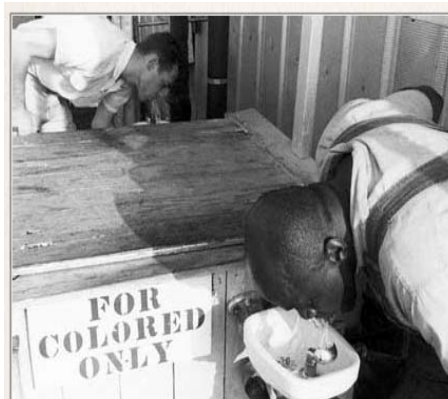
Segregated water fountains as part of the Jim Crow laws.