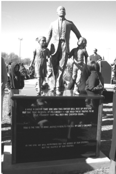
MLK Memorial Statue Community Park, Chico