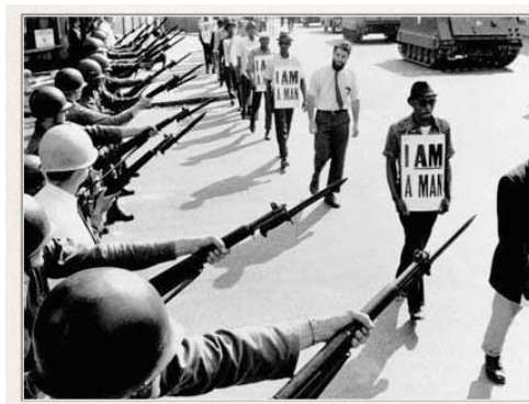
Civil Rights activists are blocked by National guardsmen brandishing bayonets and flanked by tanks while staging a protest in Memphis Tennessee.