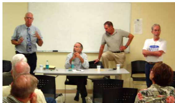
Presenters of the PCTN Community Forum “Health Care Reform” in August 2011.